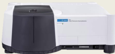
Cary Eclipse Fluorescence Spectrophotometer Cary 60 UV-Vis