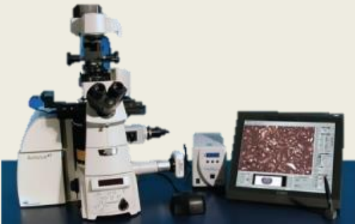
Laser capture microscope Life technology, Arcturust XT