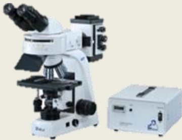
Fluorescent microscope Lieca-DM3000 B LED/With digital camera