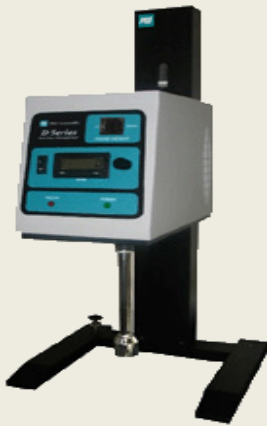
Tissue homogenizer PRO Scientific D- Series