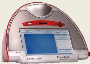
Cell Counter Invitrogen COUNTLESS