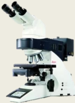
Upright light microscope Lieca-DM 1000