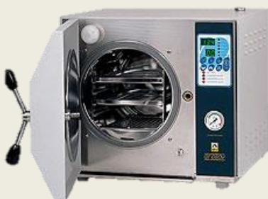
Autoclave Systec DE-45