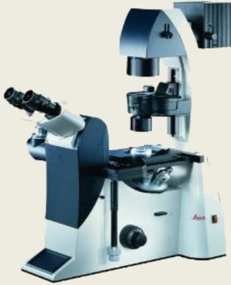
Inverted Light Microscope Lieca-DMI6000