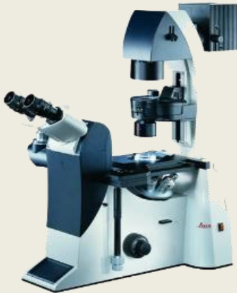
Inverted Florescent Microscope Lieca-DMI3000