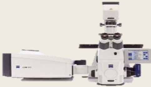
Confocal Imaging Microscope Laser Scanning Microscope (CLSM) Zeiss -LSM780