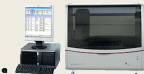
Immunohistochemistry (IHC) Dako Auto-stainer AL204