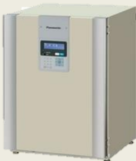
CO2 Incubator SANYO MCO-19AIC