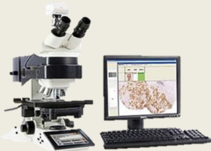
Automated light microscope Lieca-DM4000 B LED/With digital camera