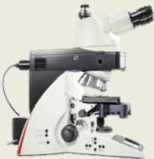
Upright light microscope Lieca-DM4000 B LED/With digital camera