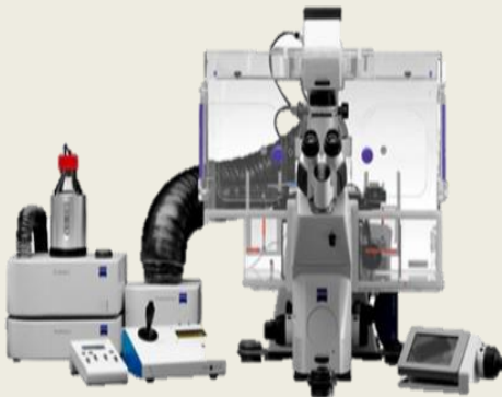
Live Cell Imaging Microscope Zeiss- Observer.Z1