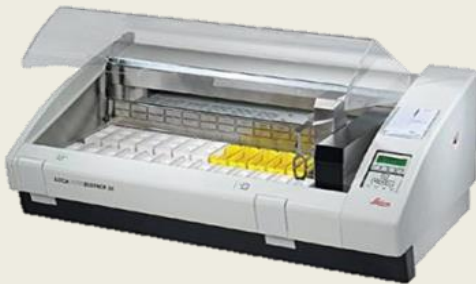
Multi Auto strainer Lieca-AUTOSTAINER XL