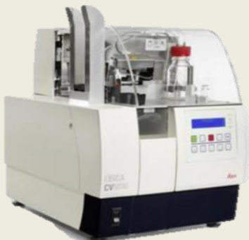
Automated cover slipper Lieca-CV5030