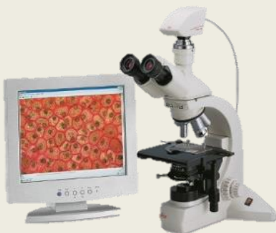
Compound Light Microscope Lieca-AUTOSTAINER XL