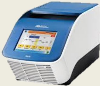
Thermal Cycler-Veriti 96-well Applied Biosystems