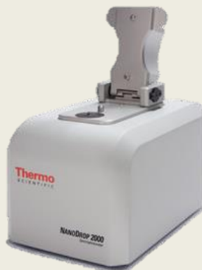
Nanodrop2000 Thermo Scientific