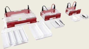
Agarose Gel Electrophoresis

PS 300 T Mini power pack by Biometra An Analytik Jena Company