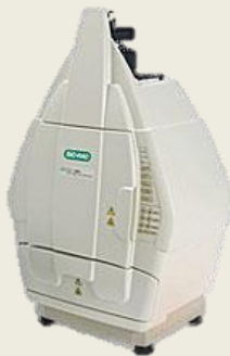
Gel Doc XR Gel Documentation System

PS 300 T Mini power pack by Biometra An Analytik Jena Company