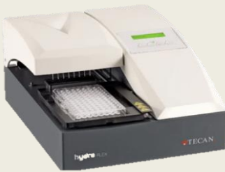
HydroFlex Plus microplate washer