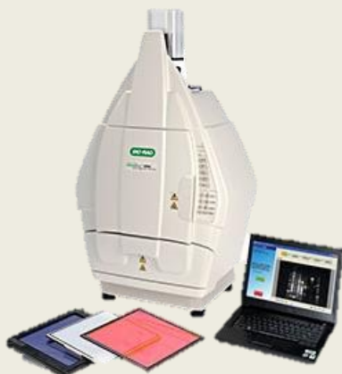
Chemi doc MP Imaging System