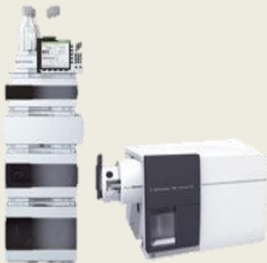
HPLC Infinity 1290 + Evaporating Light Scattering Detector (ELSD)