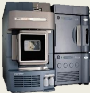
UPLC- LC/MS Triple Quadrupole