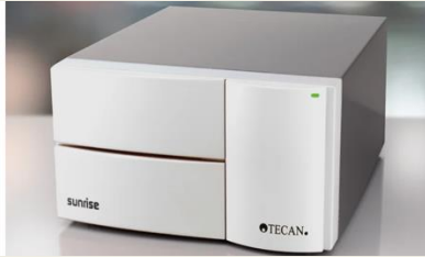
Tecan Sunrise microplate Reader