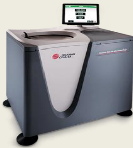
Optima XE-100 Ultracentrifuge